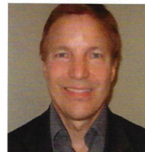
Jack S. Scaglione Insurance

11700 N 58th Street 2nd Floor, Suite F Tampa, FL 33617 (813) 504-1645 www.jackscaglioneinsuranceagent.com JScaglione3@briighthouse.com