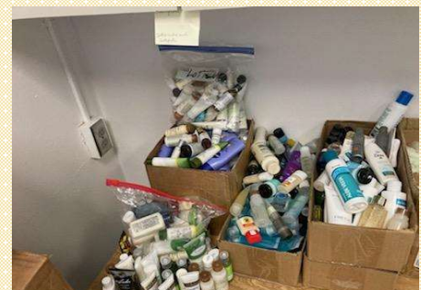
Donations dropped off at Plant City Police Station