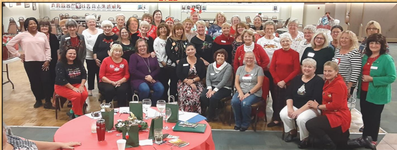
Brandon Ladies of Elks Christmas Dinner & Tree Decorating Party on December 2, 2019