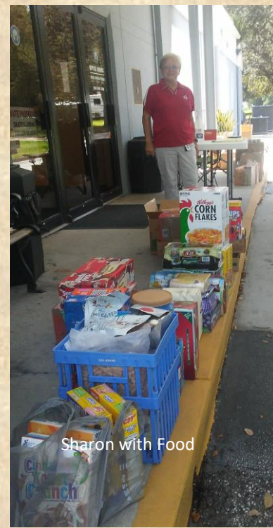
Sharon with Food